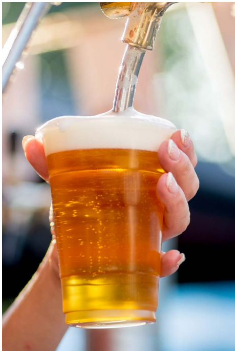
Beer and Cider Drinks

CO 2 Vapour Polishing Multi Stage Filtration for the Beverage Industry