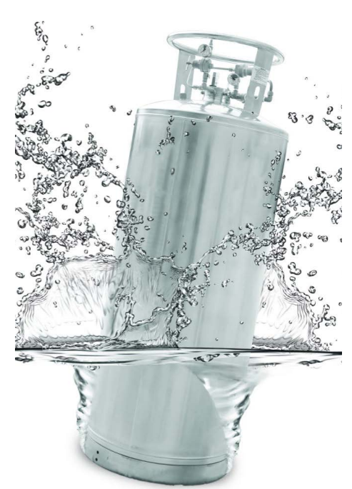
and other high purity applications